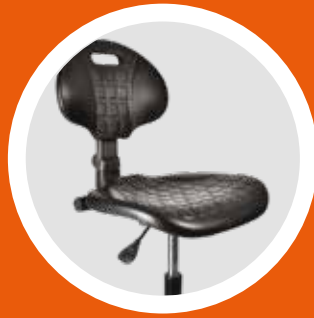
integral foam / ESD