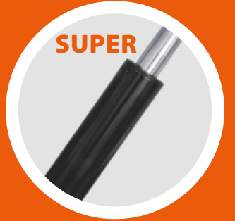
super gas lift