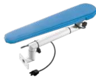
Braccio stiro aspirante Vacuum ironing arm